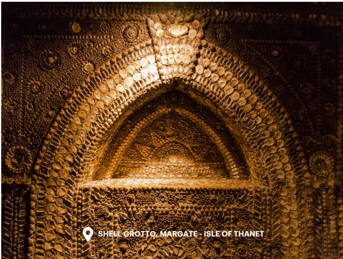
SHELL GROTTTO, MARGATE - ISLE OF THANET